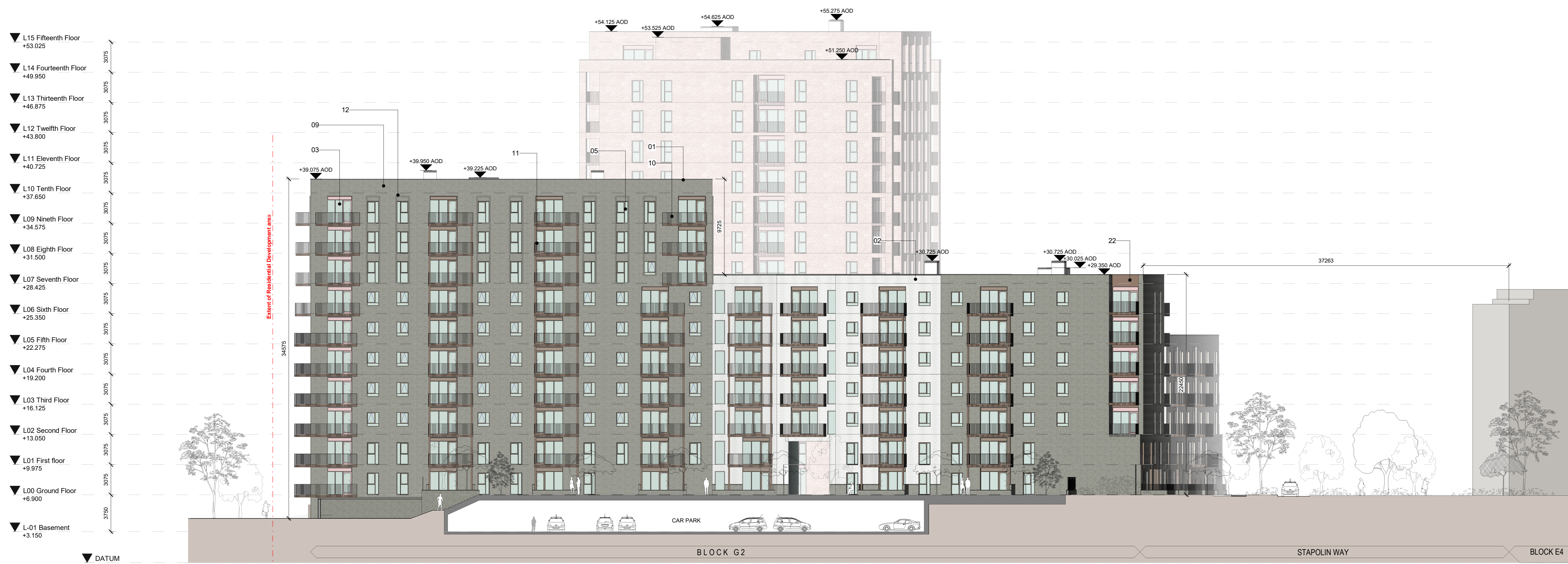
4 Section BB 1 : 200